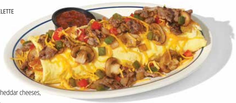
BIG STEAK OMELETTE

Made with a splash of buttermilk & wheat pancake batter! Served with choice of 3 Buttermilk Pancakes, Hash Browns or Buttered Toast. Substitute 3 Flavoured Pancakes (from pancakes sections), 3 Gluten-Friendly Pancakes or Fresh Fruit.