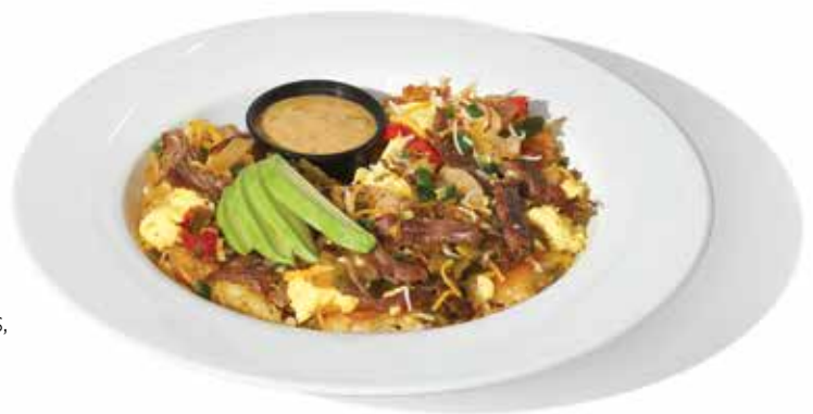
SPICY POBLANO FAJITA BOWL

Southwest Chicken Grilled chicken, scrambled eggs, bacon pieces, red peppers & onions, tomatoes, queso sauce, shredded Jack & Cheddar cheeses, hash browns, avocado & a side of salsa.