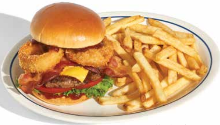
COWBOY BBQ STEAKBURGER

Sides Choice of French Fries, Onion Rings or 2 Buttermilk Pancakes. Substitute Fresh Fruit or Side Salad.