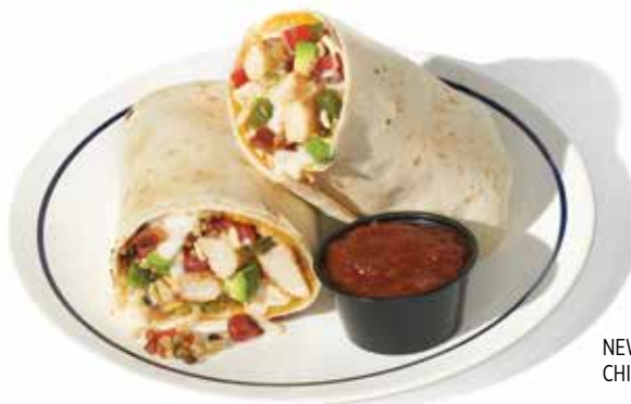
NEW MEXICO CHICKEN BURRITO

New Mexico Chicken Grilled chicken, bacon pieces, red peppers & onions, tomatoes, queso sauce, shredded Jack & Cheddar cheeses, avocado, rice medley & a side of salsa.