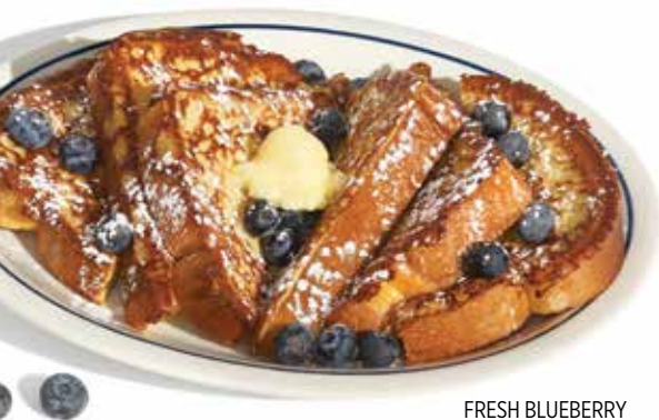
FRESH BLUEBERRY FRENCH TOAST

Belgian waffle, 2 eggs & 2 bacon or 2 sausage.