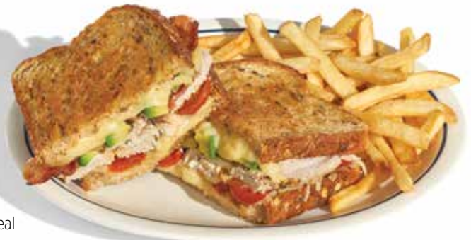
ROASTED TURKEY MELT

Crispy chicken breast strips tossed in Franks RedHot® Buffalo sauce, pickles & Swiss cheese on grilled, thick-cut bread. Comes with ranch sauce for dipping.