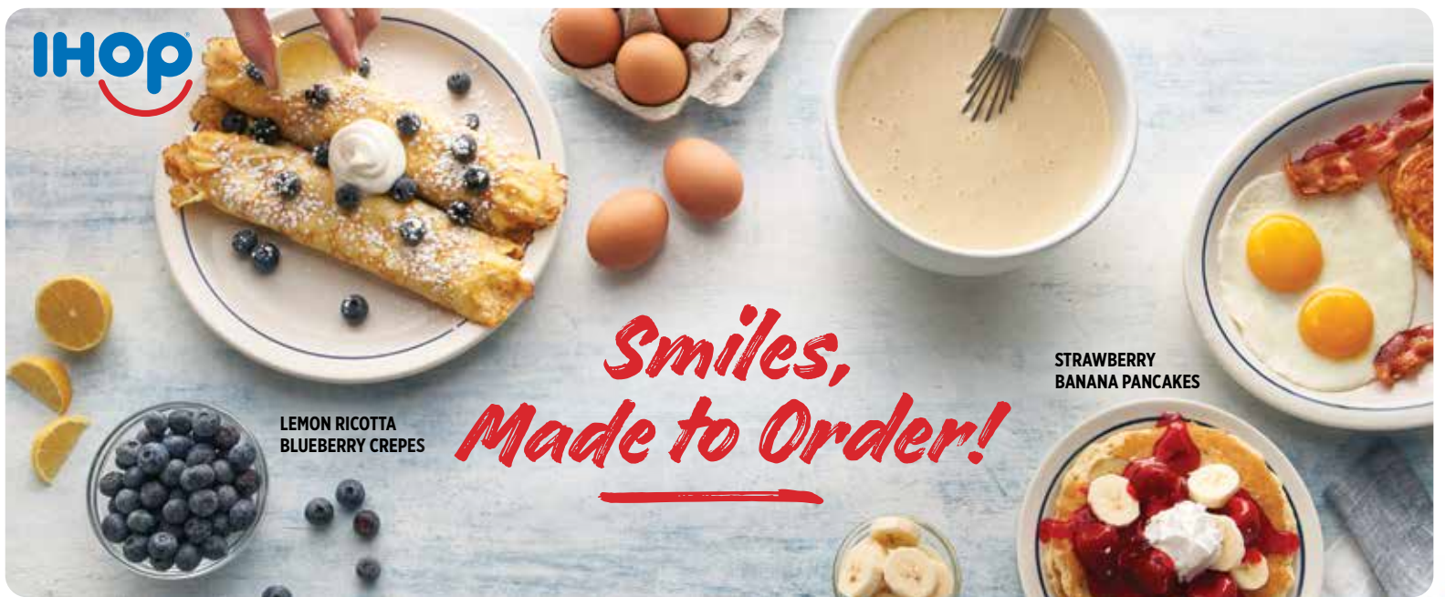
LEMON RICOTTA BLUEBERRY CREPES